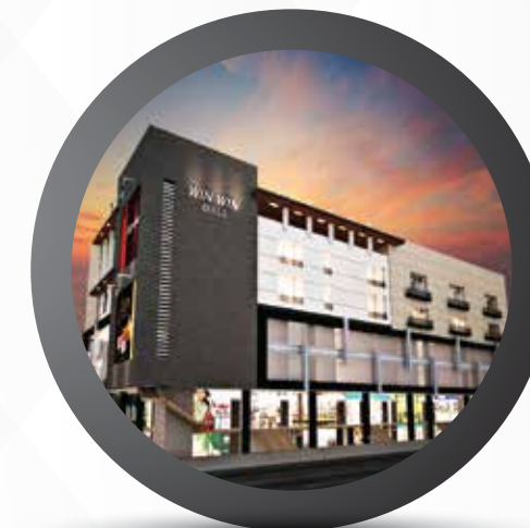
WIN WIN MALL F-17