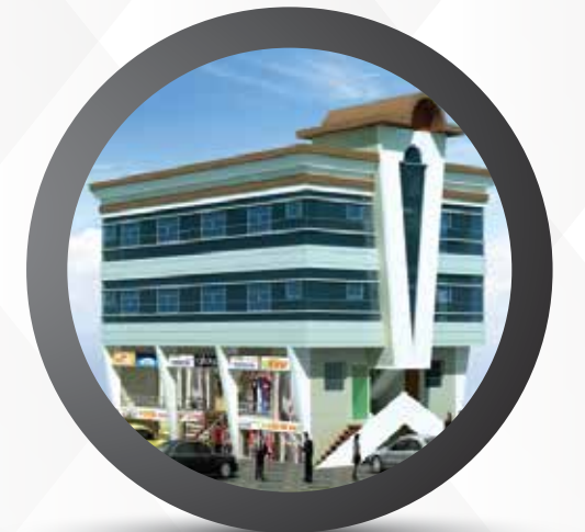
WIN WIN SQUARE F-17