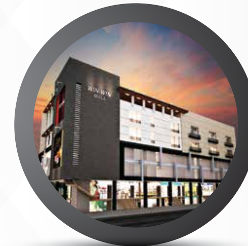
WIN WIN MALL F-17