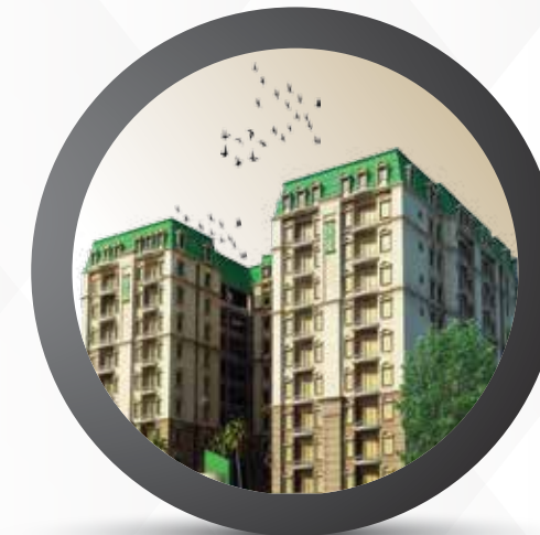
MARGALLA HILLS I E-11/1

With more than decade of excellence behind them, Win Win Associates is a name that is synonymous with luxury and fine living, also adhering marvelous opportunity for business community and entrepreneurs. It has redefined high end lifestyles through innovation and superior planning and cemented itself as the leading Real Estate developer in Pakistan in particular. The goal hereby is the development and management of a globally diversified and centrally managed real estate portfolio on behalf of the Win Win investors.