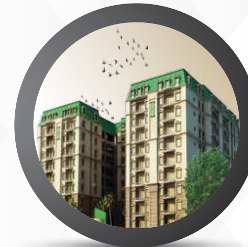
MARGALLA HILLS I E-11/1

With more than decade of excellence behind them, Win Win Associates is a name that is synonymous with luxury and fine living, also adhering marvelous opportunity for business community and entrepreneurs. It has redefined high end lifestyles through innovation and superior planning and cemented itself as the leading Real Estate developer in Pakistan in particular. The goal hereby is the development and management of a globally diversified and centrally managed real estate portfolio on behalf of the Win Win investors.