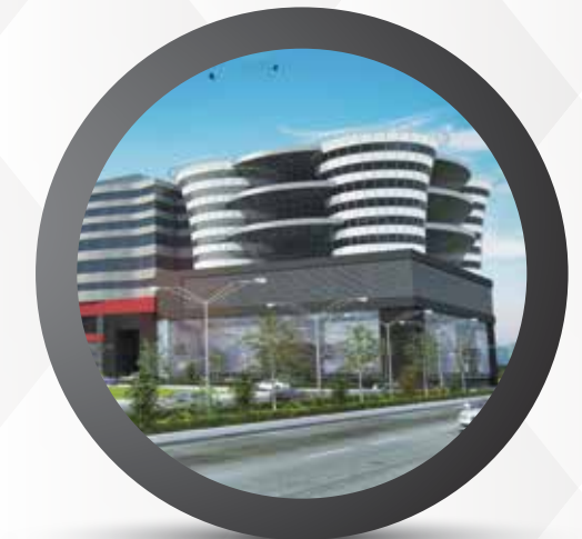
ATLANTIS MALL F-17