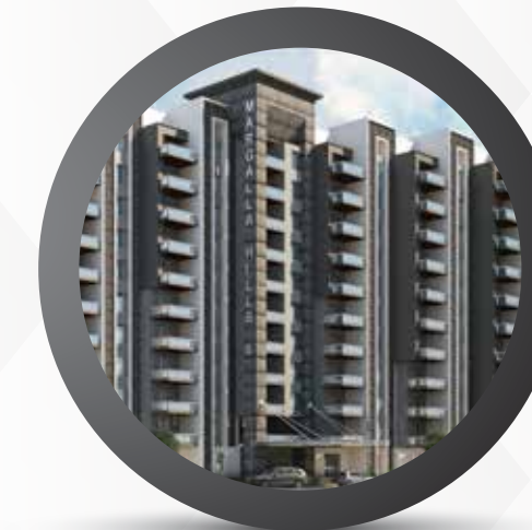
MARGALLA HILLS II E-11