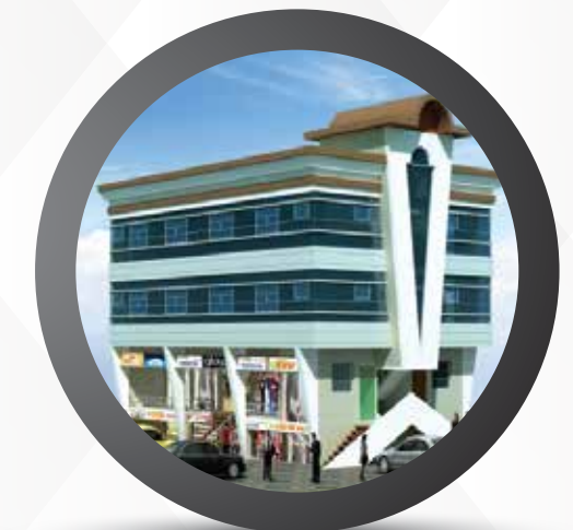
WIN WIN SQUARE F-17