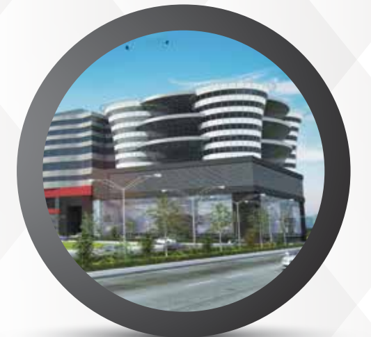
ATLANTIS MALL F-17