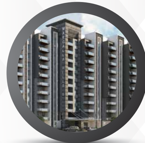
MARGALLA HILLS II E-11